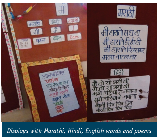
Displays with Marathi, Hindi, English words and poems

mother tongue and regional language. Storybooks in English can also be made available.