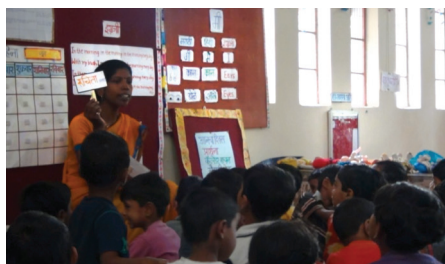
Teacher using name cards to encourage sight word reading